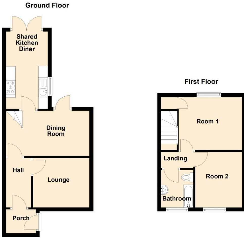
19 Fair View, Barnstaple